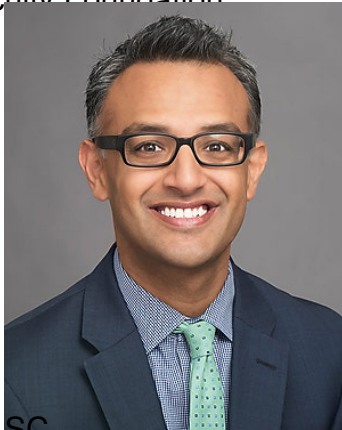
David R. Hitt, MD Associates, SC